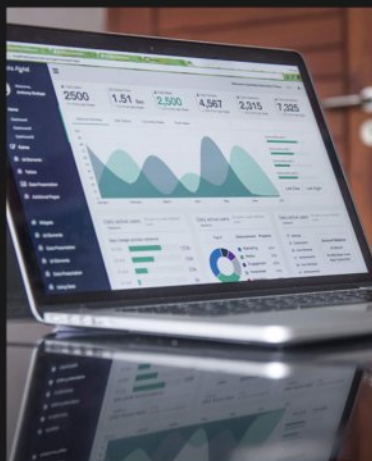
Inside Sales Support

Deliver expert assistance, troubleshooting, and solutions to customers, and resolving issues promptly.