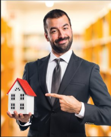
Customer Support Desk